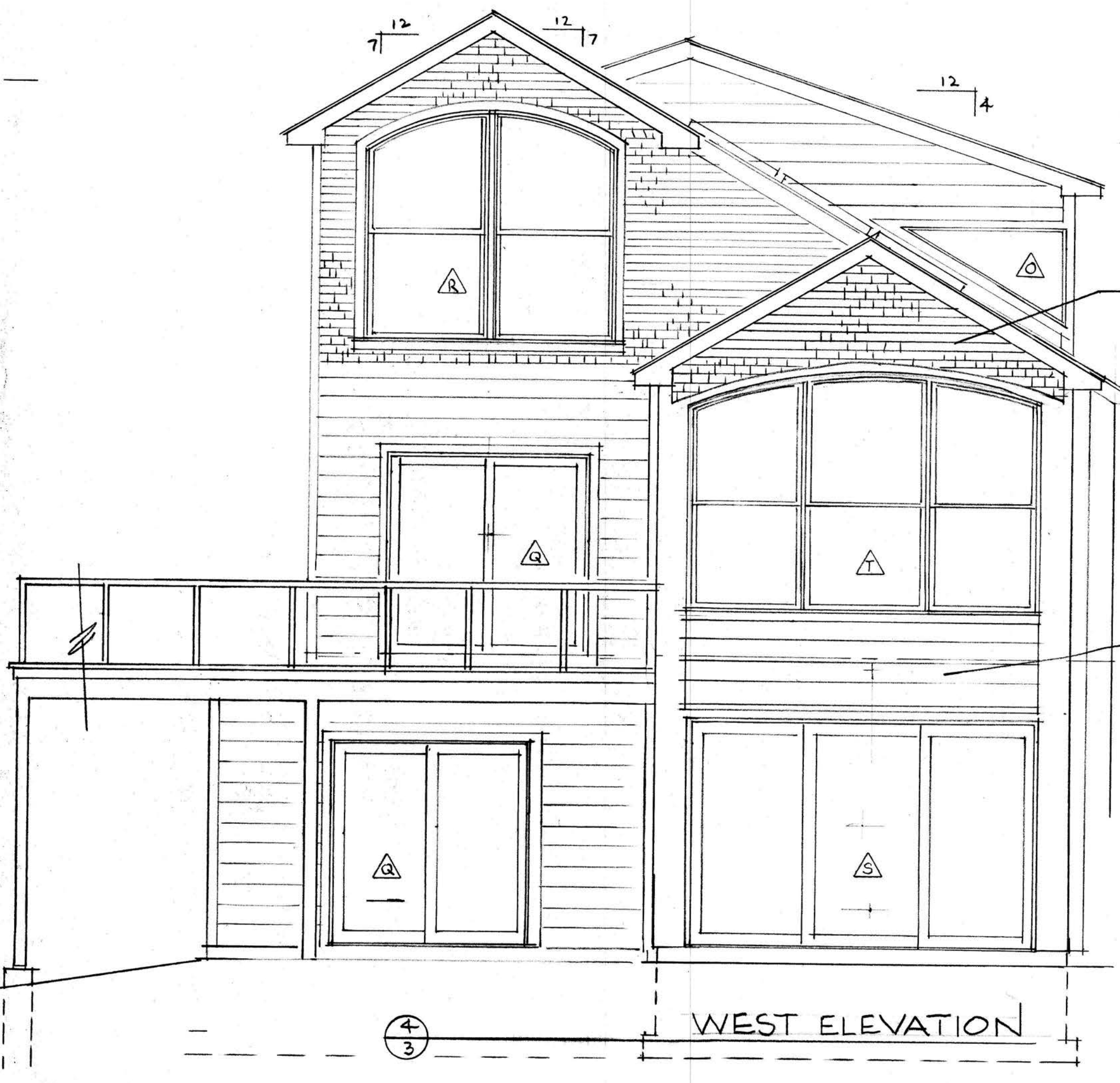
WEST ELEVATION 4 3